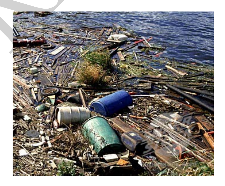
Figure 3: Non-potable Water Collection

It is at this point that many professionals just 'grab and go' without thought to the analytical or legal 'bottom line'. This overview is not intended to focus on these issues, but a CIH must be aware of these factors when collecting their 'fish guts and crud' samples.