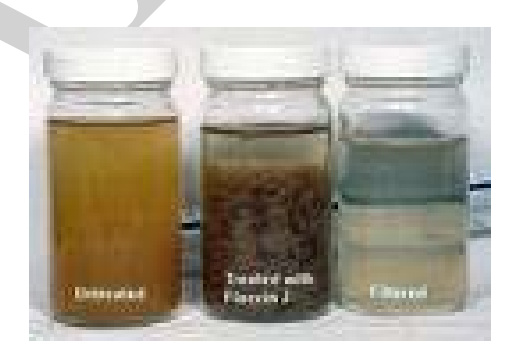
Figure 1: Typical 'non-standard' water samples for asbestos analysis

As the Laboratory Director of a large asbestos environmental laboratory since 1992, like many of my colleagues, I have seen countless examples of 'non-standard' samples. Human tissue samples, biohazard-filled muck (use your imagination), and of course, who would forget the cockroach. Yes, a major building owner in a large East Coast city submitted a cockroach. Their theory... "this particular critter was responsible for transporting asbestos from place to place throughout the building." No kidding! We did analyze the cockroach by several means and found no evidence of asbestos mineral. We did however later learn that he was employed illegally and without the proper training and certification documents to perform any asbestos remediation. [I'm sure the Synergist editorial board will get some responses to this from my brothers and sisters involved in laboratories with even more bizarre stories.]