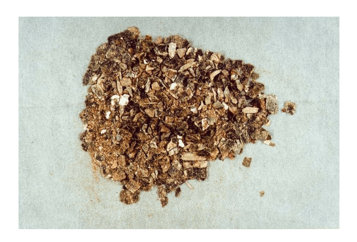
Figure 3. Example of Sediment or "Sinks" After Flotation of VAI

Libby are characteristic (Bandli and Gunter, 2001) (Wylie and Verkouteren, 2000), and with experience, the analyst need go no further than mounting representative fiber bundles in a high dispersion liquid of refractive index 1.630, in which the very fine fibers exhibit dispersion staining colors of magenta to gold (parallel) and blue (perpendicular). Representative fiber bundles may be examined by SEM or TEM, and the EDS spectra obtained may be used as the basis for identification. Examples of EDS spectra for Libby amphiboles are shown in Appendix A.