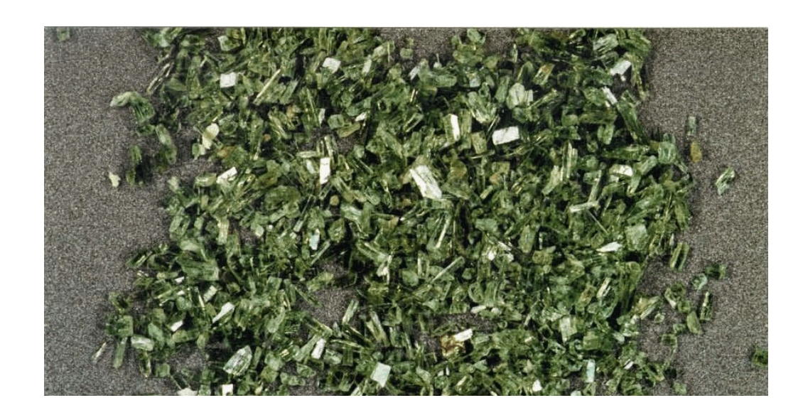
Figure 5. Example of Non-Fibrous Tremolite Detected in a Vermiculite Sample

(Scale divisions = 1 mm)