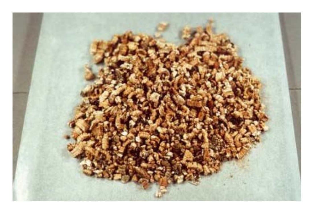
Figure 1. Example of Exfoliated Vermiculite Attic Insulation

morphologies from acicular to asbestiform. Vermiculite from other sources may or may not contain fibrous amphibole. During the beneficiation the fibrous amphibole may, to a large extent, be removed from the vermiculite. However, some of the fibrous amphibole, if present, may pass through the beneficiation process and appear in the final vermiculite product.