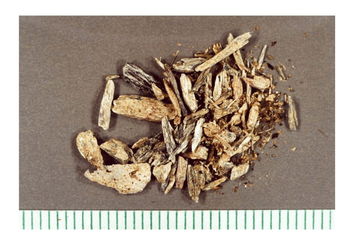
Figure 4. Fibrous Amphibole Bundles Hand-Picked from Sinks after Flotation of VAI which Originated from Libby, MT.

(Scale divisions = 1 mm, Photo by E. J. Chatfield)